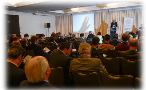
115 participants from 8 different countries attended the PROFEL Conference

With 115 participants, the event was well attended, both by the industry and policymakers.